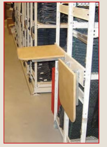
Drop Down Tables