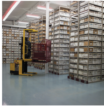
CDSA, City of Québec