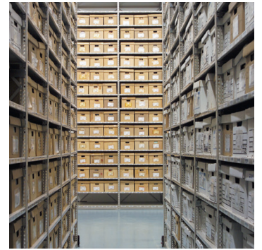
CDSA, City of Québec